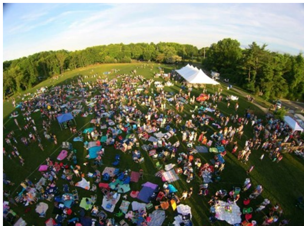
Aerial photo of FAIR HAVEN DAY held at Fair Haven Fields