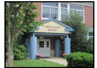
Knollwood School (4-8)

The mission of the Rumson-Fair Haven Regional High School District is to provide all students the knowledge, skills and environment for them to be competent, self-assured, lifelong learners in a diverse and changing world. The district recognizes the importance of talented students, concerned parents, exceptional staff and a supportive community as the center to its commitment to excellence and a tradition of results.