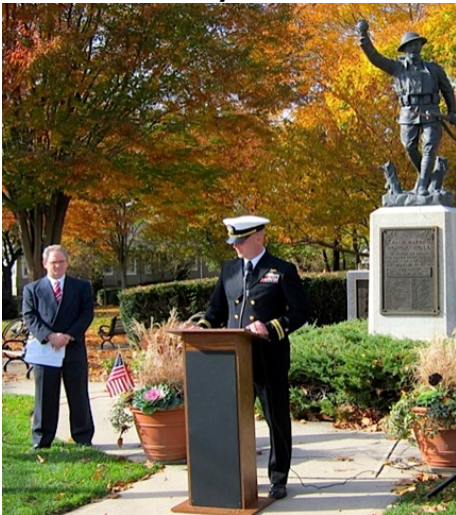
Veteran's Day Ceremony