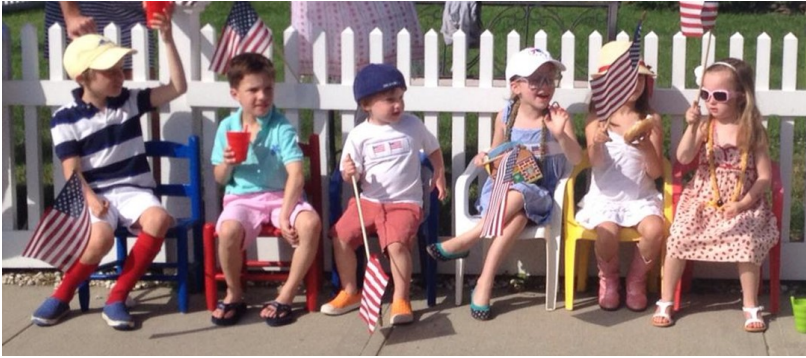
Memorial Day Celebration