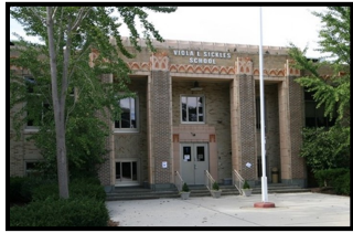
Sickles School (Pre-K-3)

The Fair Haven Public School District is a highly successful Pre-K through 8 district dedicated to providing our students with a broad academic foundation, nurturing their talents and abilities, and inspiring them to be lifelong learners. Comprised of the Viola L. Sickles School for grades Pre-K through 3 and the Knollwood School for grades 4-8, the Fair Haven School district has a combined student population of approximately 1000 students. Upon eighth grade graduation, Fair Haven students attend Rumson-Fair Haven